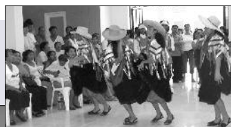
◀ Dancers added to the festive celebration.