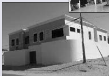
▲ The new St. Vincent de Paul Center.

May 4 was a grand day in Piura, Peru, as villagers, hermanas and friends gathered for the dedication and blessing of the new Centro San Vicente de Paul. An estimated 350 people attended the festivities that included Mass, renewal of vows by the Hermanas de Caridad, lunch, music and dancing. The hermanas will use the center for classes and for health services.