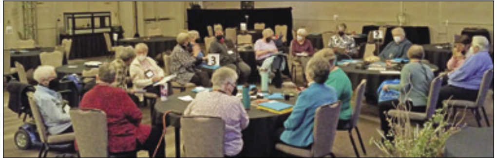
Dialogue was an important component of Chapter 2022 led by facilitators trained for their roles.