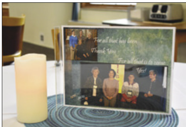
This visual in the Mother House Dining Room celebrates those who served from 2016-2022 and the new Community Council.

On July 17, during Mass, a special ceremony and receptions that followed, Sisters and SCL Associates had the opportunity to bless, congratulate, and express good wishes to members of the new SCL Community Council.