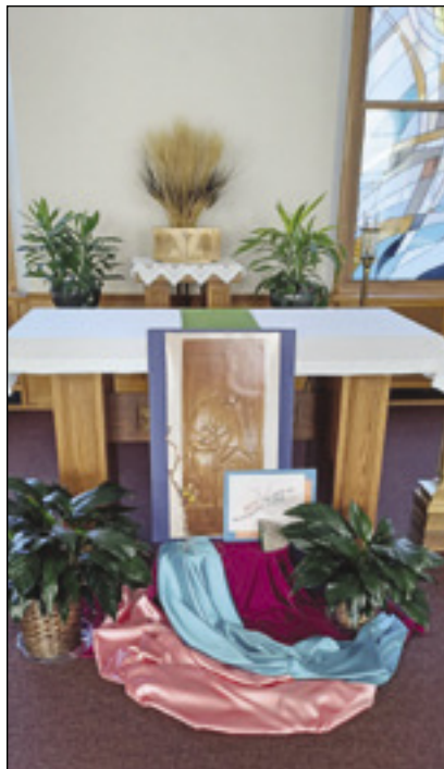
At the SCL Mother House, Sisters unable to attend Chapter remained connected via visuals in Ross Chapel and through live streaming.