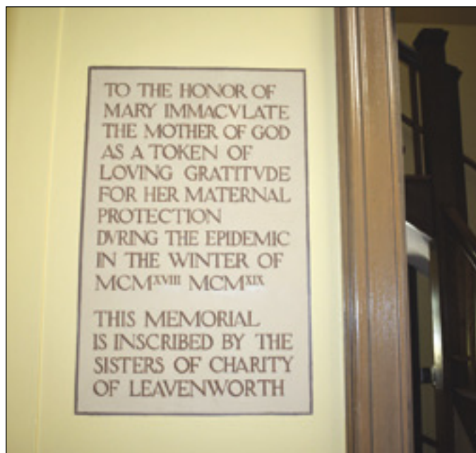
This dedication to the Sisters who died as a result of the Spanish flu was painted on the wall of Annunciation Chapel on the SCL campus.