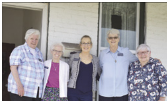
The Leavenworth Attainable Housing (LAH) Committee in front of the first home rehabbed by LAH that is now occupied by a tenant.